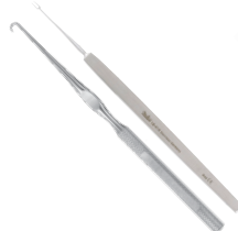
Hooks and Retractors